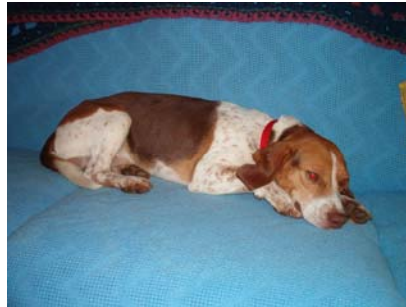
Rudy is currently in foster care.

Fostering can be a great learning opportunity for children to teach them about the responsibilities of pet ownership, and the love and affection it can bring, without having a long term commitment!