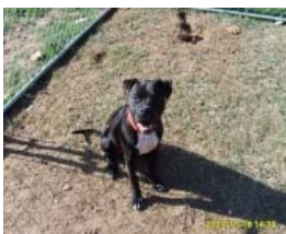
Moxie—Pit Bull Terrier mix, female, approximately 1 year old

One of four dogs left homeless as a result of her owner being beat to death (yes, right here in Monroe county). She was not a puppy, or fluffy adult; she's the "wrong breed". She's in our foster care. Her foster Mom writes: She is a lap dog - she's one of those dogs that likes to bury her head and she would give up just about anything