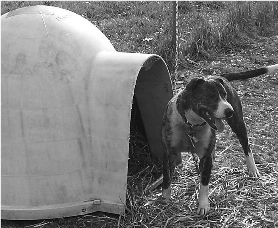
Lady is thankful today! She now has a nice house to get out of the weather and relax in.