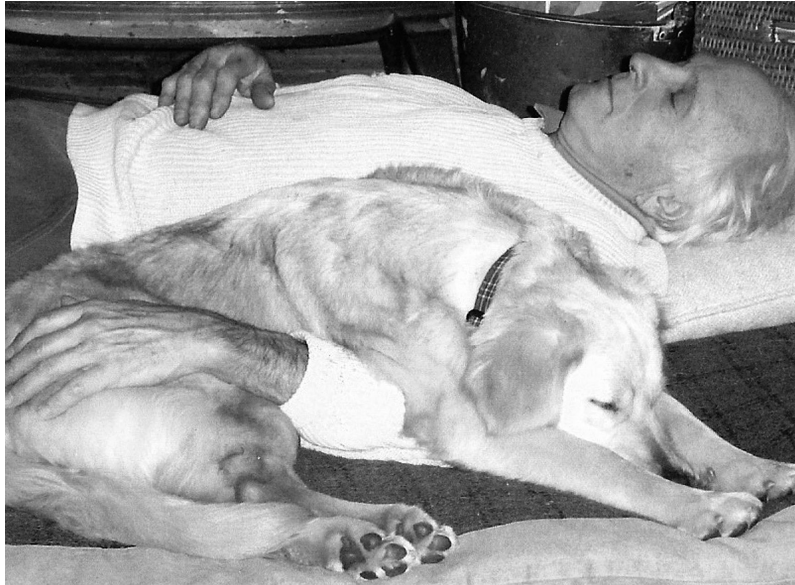
Curled up by a warm stove in the arms of my loving owner, I am grateful.