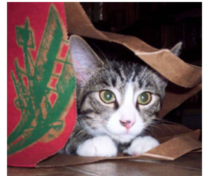
Unsinkable Mollie in bag hiding, 6 mos

It's been slow, but Flynn now is part of the family. He is most comfortable when my other cats are around, as he plays off their "cues". Flynn comes in the house to eat when he is hungry, and he lets me hold and cuddle him. He has the loudest purr when he is being "loved up". Although he sleeps out-