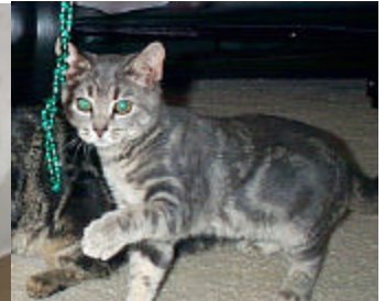
Storm— silver tabby, sweet and lovable, 11 mos old