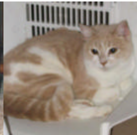
Fluffy —buff and white, adorable and low-key