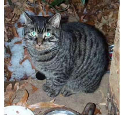
Feral Kitty on front porch