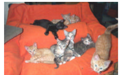
Eight kitties lounging