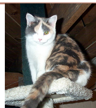
Gretta- a "single cat" kitty