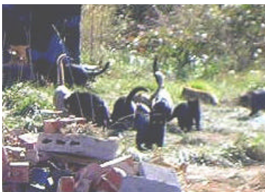
Cats after house razed.