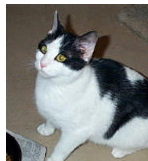
I am right here and waiting!