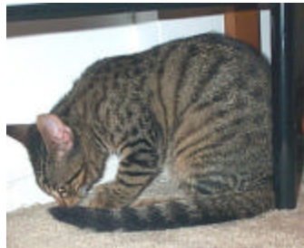
Timmy— brown tabby, curious and sweet, 11 mos