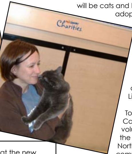
First adoptions at the new PetSmart Collegeville: Brenda and Crosby were the first happy SCBI adoption pair.

in the North Wales area. We are ready to develop the same high visibility organization in the Collegeville area," she adds. Last year, Stray Cat Blues, Inc. did over 700 adoptions, spayed and neutered approximately 1,200 cats, and placed nearly 30 unsocialized cats in safe barn homes.