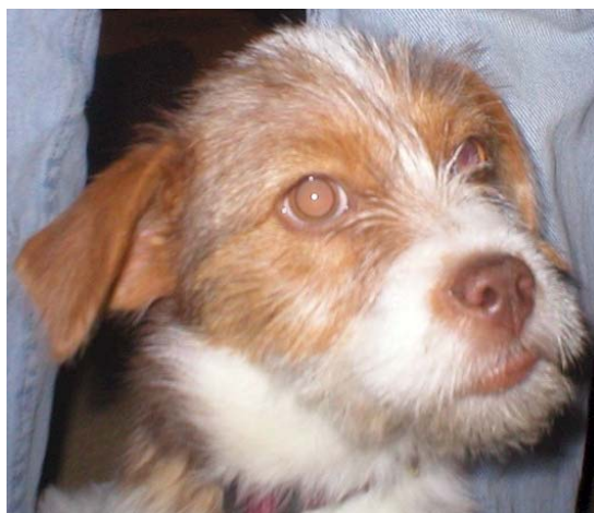
Amy is an adorable 3-month old terrier mix pup who was left with her brother at an animal shelter. He was adopted before she was so alone and afraid, Amy was close to dying of starvation and dehydration when she was taken into foster care. She is now healthy, happy, and has two girls and a young boy!